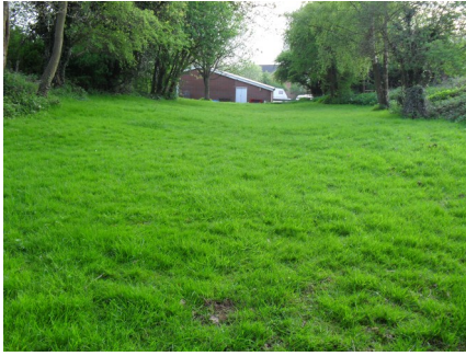
114th Trentham Scout Group

The Ron Boulton Scout House Churchill Avenue Trentham Stoke-on-Trent ST4 8PF