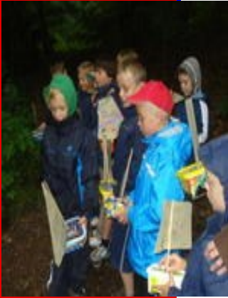
Beavers with their boats on the Group Camp