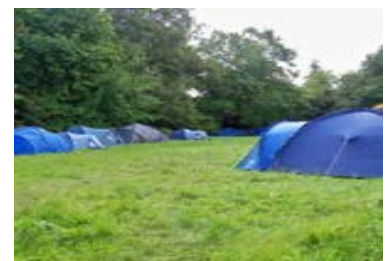
Tents purchased with Gift Aid money last year

in the group who are also UK taxpayers complete a gift aid form. If you are unsure whether you've already completed a form please speak to one of the leaders.